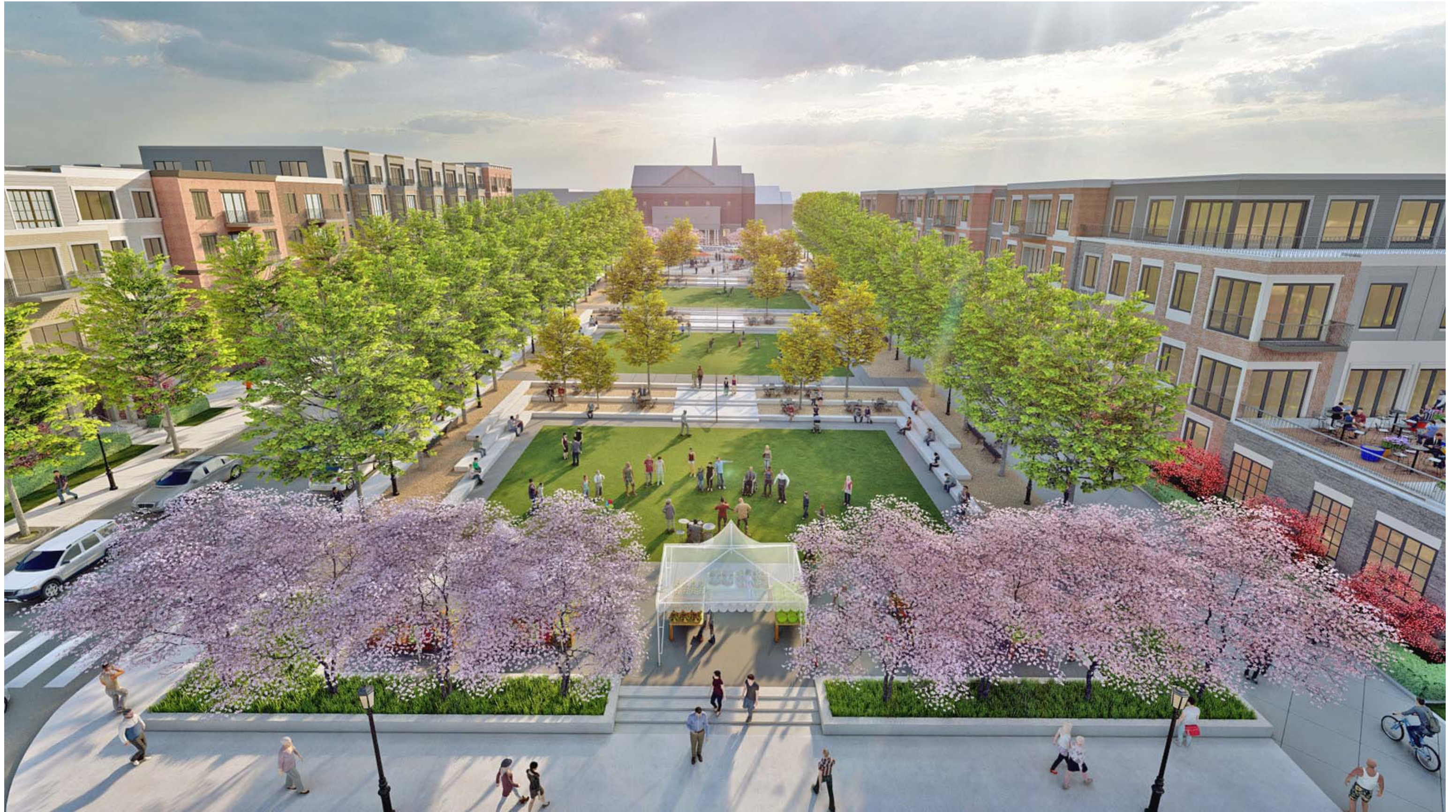
Central Park View Looking North